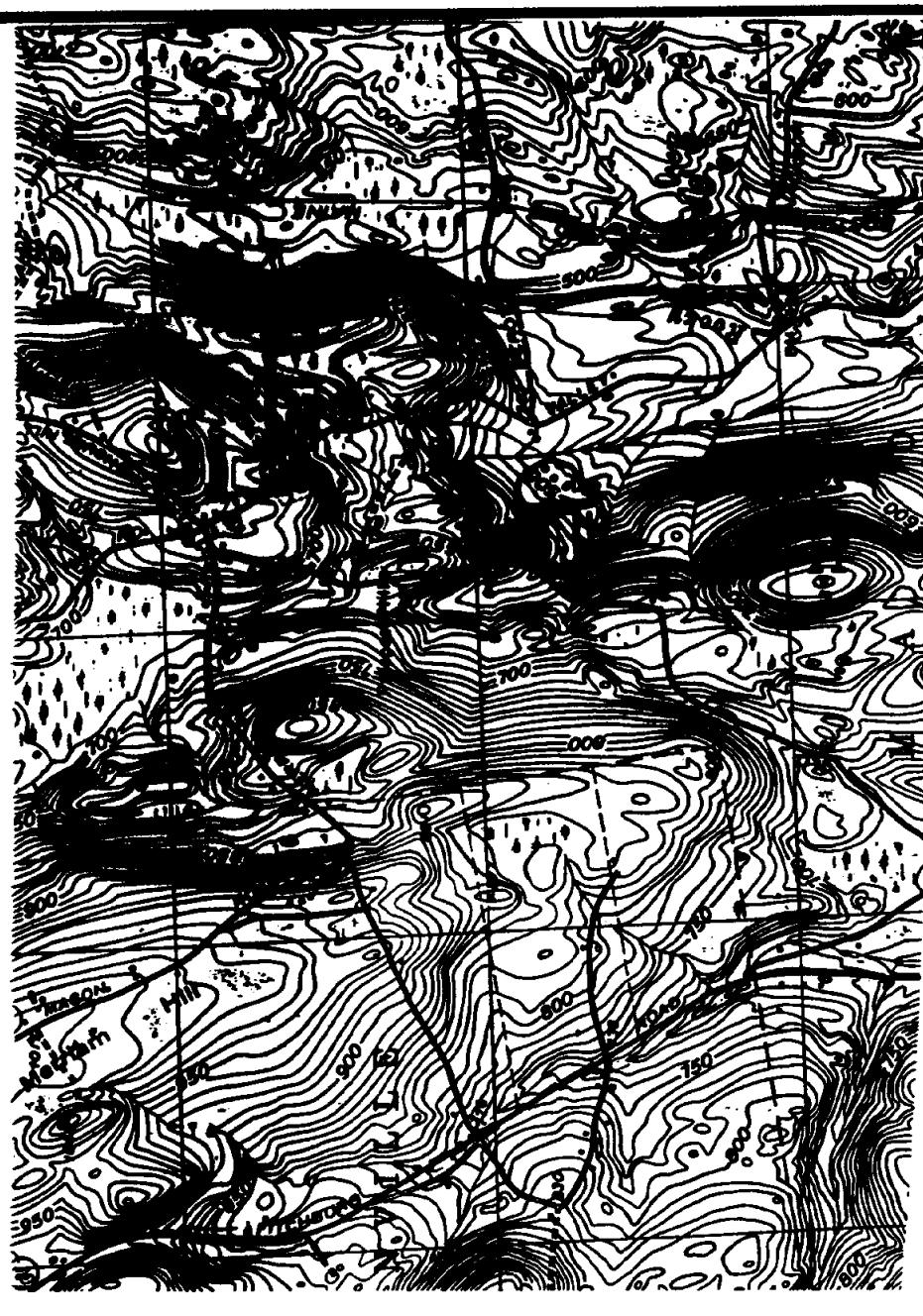
LOCUS PLAN 1" = 2000'

PATRICIA M. LIGHTIZER 150 WOODWARD ST. NEWTON HIGHLANDS, MASS. 02461